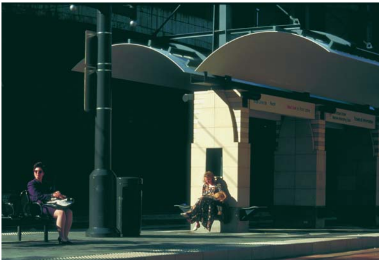
Pearl Street Station