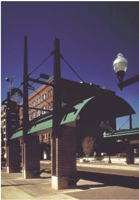
West End Station