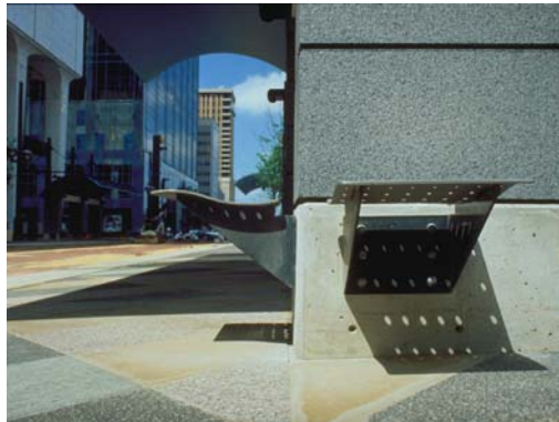
Akard Street Station, custom seat detail