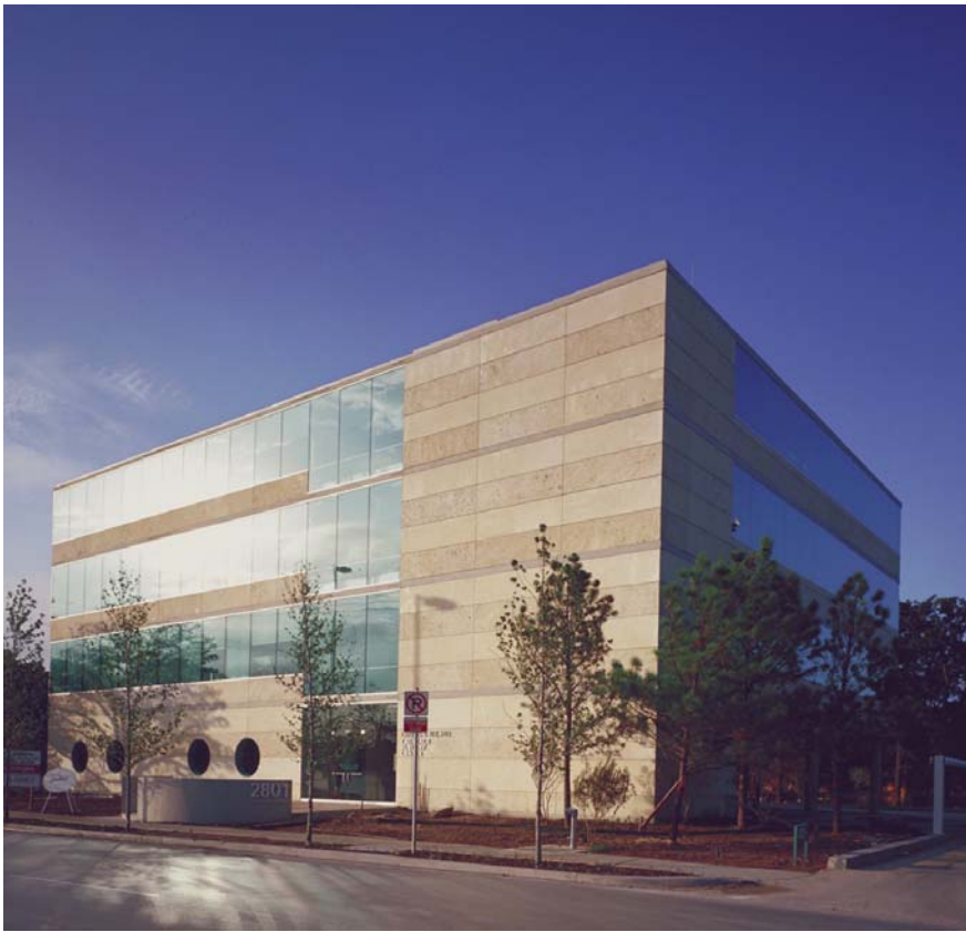
2801 Lemmon Avenue West, Dallas, Texas

Key Cataract Surgery Center and Clinic occupies the top floor of this four story office building. Public spaces and an optical shop are at grade with clinical office spaces on intermediate floors, and the majority of the parking is below ground. The site's allowable building envelope and use within the zoning is maximized.