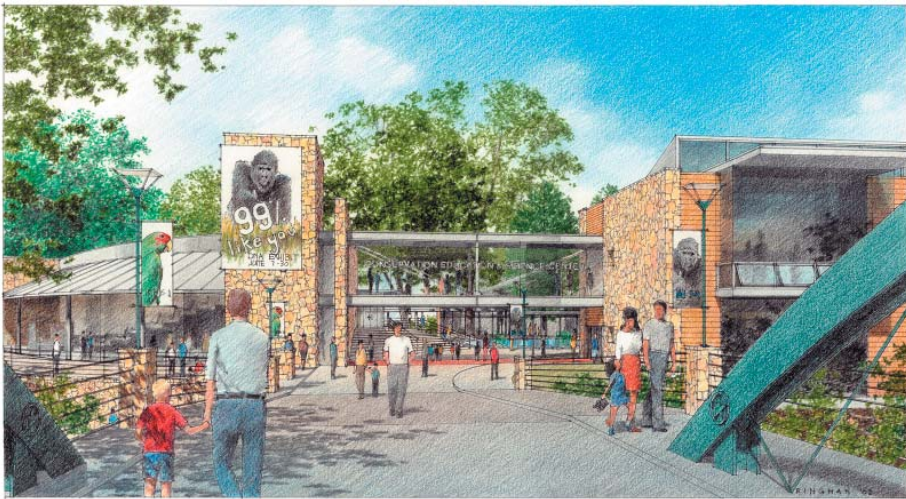
view walking from parking area across bridge over Cedar Creek towards CESC entry

A new education and science facility is being planned by Oglesby · Greene for the entrance to the Dallas Zoo. This 70,400 sq. ft. structure is to be a teaching laboratory for conservation of the world ecology systems. It will include research, teaching and interpretive facilities as well as serve all arriving visitors to the Dallas Zoo. This sustainable facility is to be LEED certified silver level category.